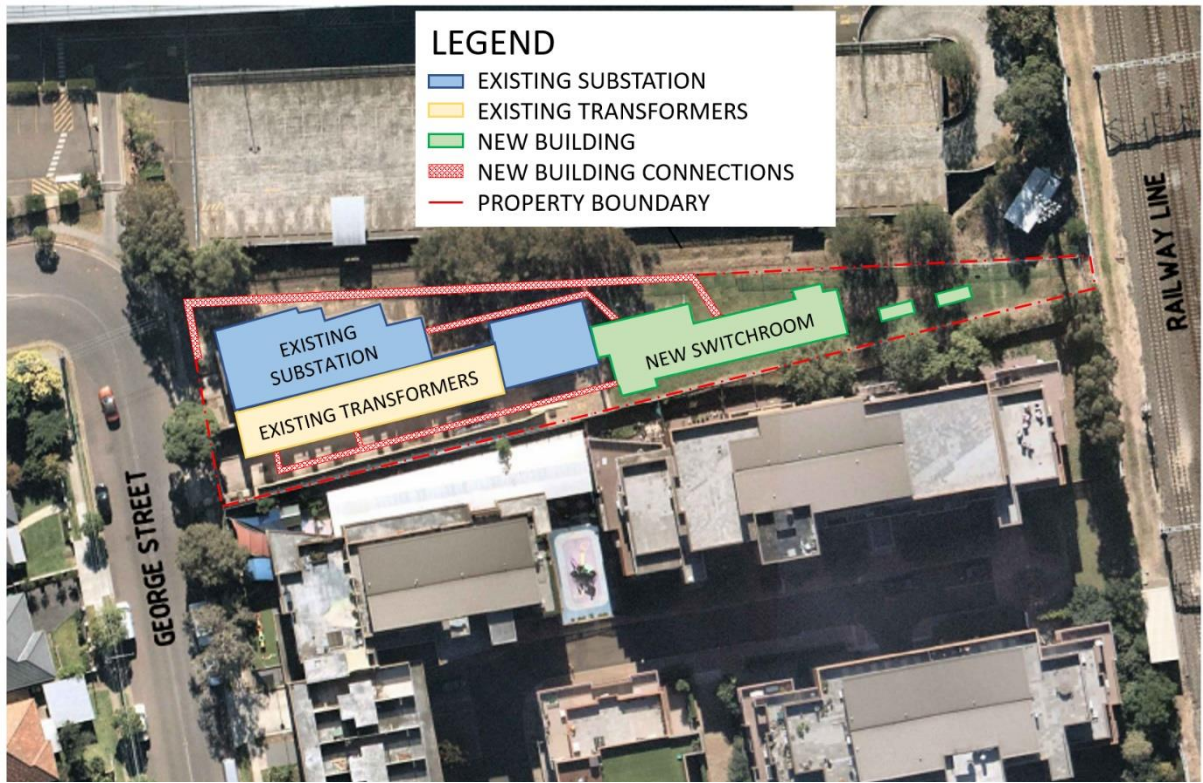
Figure 1: Concept of Substation upgrade works at 31 George St, Concord West.