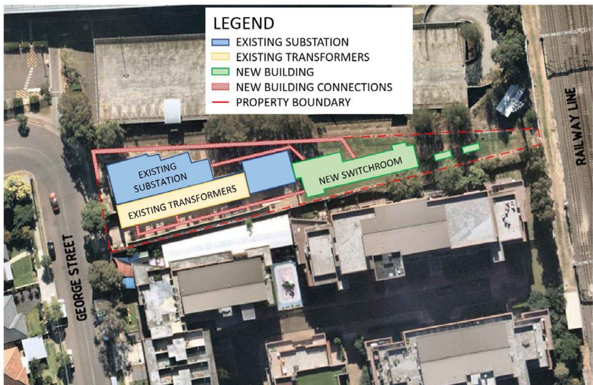
Figure 1: Concept of Substation upgrade works at 31 George St, Concord West.