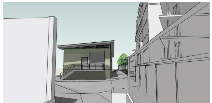
Image 2. View from eastern end of Ausgrid's driveway

This finish will provide superior weather proofing protection to the building. The roof will be clad with high grade Colorbond roof sheeting.