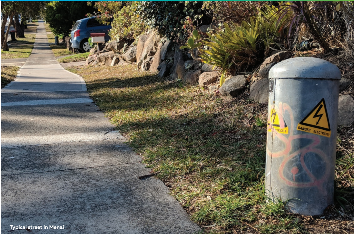
Typical street in Menai