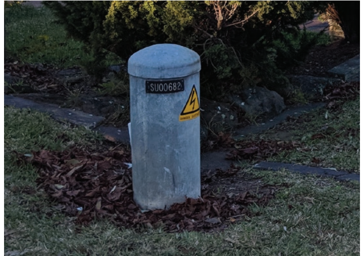
Typical pillar to be replaced