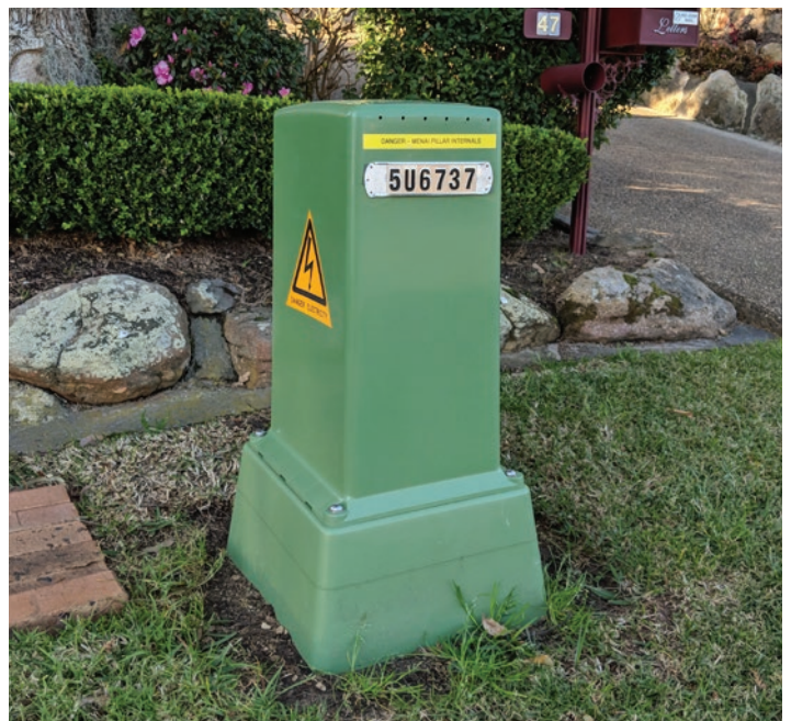
Typical current standard pillar to be installed