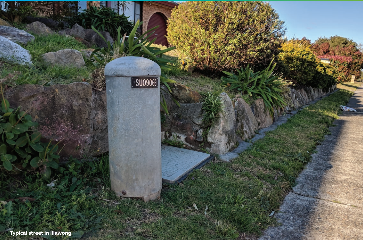
Typical street in Illawong